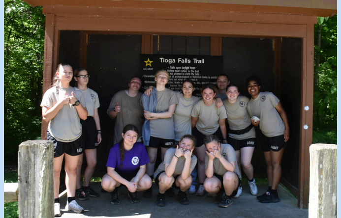
Our cadets participating in several activities!